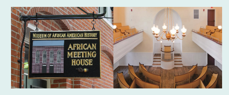
The Museum of African American History also known as The African Meeting House was built in 1806 to the Inside of the Museum of African American History Boston MA.

Graduate Medical Education Diversity & Inclusion is committed to the recruitment, engagement and advancement of underrepresented minority (URM) physicians within our residency and fellowship ranks. Through partnerships with our residency and fellowship programs, clinical departments, and administrative offices we aim to provide a diverse physician staff in order to enhance the quality of care for the patients we serve. We define underrepresented minorities in medicine as: Black/African American, Hispanic/Latino, Pacific Islander, Native American, and Native Hawaiian.