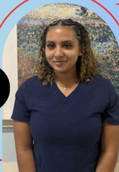
Crystal Pike Staff Award Winner