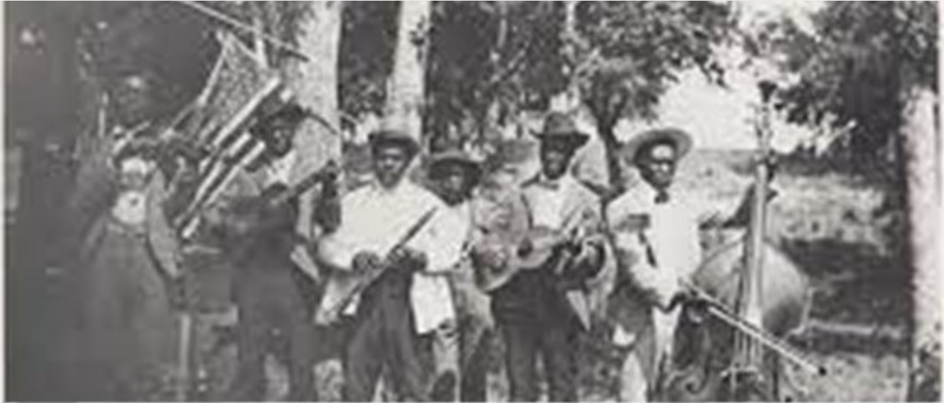
An African American band at an Emancipation Day celebration on June 19, 1900, in Austin, Tex. The event marks the day in 1865 when the last enslaved people in the United States learned they were free. Starting this year, it will become an official University holiday.