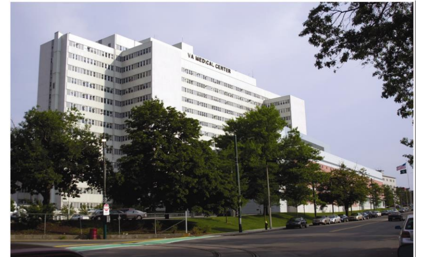
Jamaica Plains VA Hospital