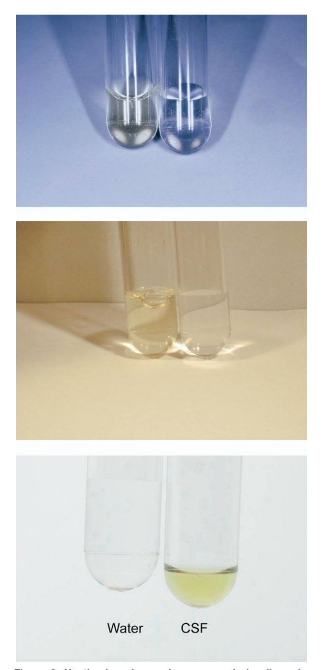
Figure 3. Xanthochromia can be measured visually or by spectrophotometry. These images show the appearance of visually measured xanthochromic cerebrospinal fluid (CSF). Technique is still important when measuring visually. Hand carry the CSF to the laboratory, rapidly centrifuge the tube, and then compare the supernatant to an identical tube filled with an equal volume of water. Note that the ambient lighting may change the ease with which one can see the color change; the top two panels are of the same specimen seen in different lighting. Some specimens (bottom panel) are more obvious than others. (This figure may be viewed in color in the web version of this article.)

perimentally, traumatic taps can result in discolored fluid from oxyhemoglobin (101).