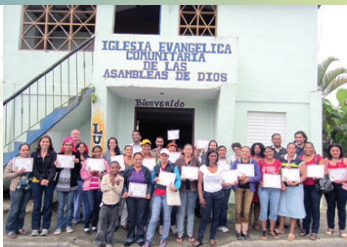
Group members and community health workers after our "Día de Salud."

Following a service-learning model, the course was split into two focus areas — with clinical work each morning and a social medicine course in the afternoons. Our clinical time was spent in Hospital José María Cabral y Báez and Clínica Santa Lucía. The Cabral y Báez is a large teaching hospital that serves as a tertiary referral center for the entire northern third of the country. Elective participants rotated through the emergency department, intensive care unit, general medicine floors, as well as outpatient clinics. Participants joined in daily rounds and clinical