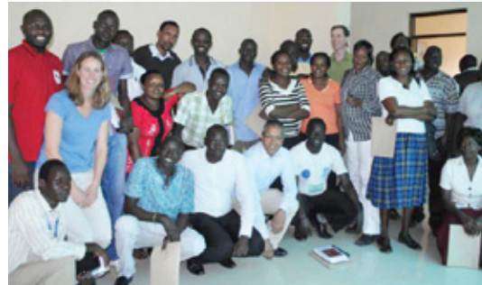
Graduating class of medical officers, nurses and midwives at the AIIT ultrasound course in Kisumu, Kenya.

Many of the trained providers came from extremely rural and under resourced clinical settings – including six Red Cross providers from the Dadaab refugee camp on the Somali border and twenty healthcare providers from various settings in the newly created country of South Sudan. Some providers can only reach their clinical site by traveling two days by boat up the Nile, making ultrasound a critical mode of imaging. The goal of this initiative is to improve the care for the critically ill and injured in these especially remote sections of Kenya, South Sudan and other vulnerable areas of Africa.