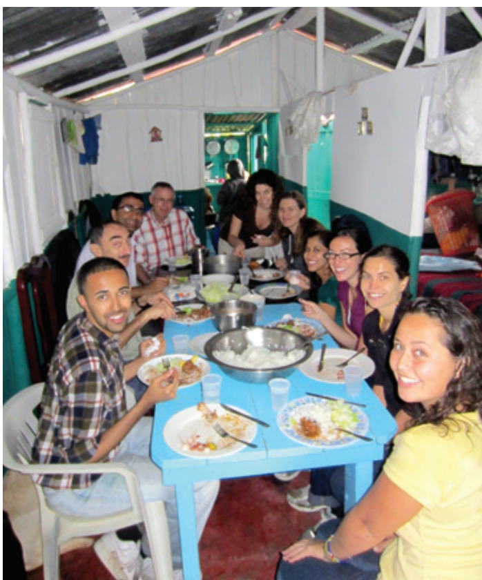
Group members enjoy authentic Dominican food.

Unfortunately, although we are on the front lines of suffering, most medical professionals are never exposed to such an anthropological approach to the problems that affect vulnerable populations. Without such knowledge, we lose sight of the context in which our medical services are needed. Just as we would not treat a fever without searching for an underlying cause, the course attempted to provide some of the tools to understand the causes that underlie our patients' suffering. While it may be impossible to teach trainees all there is to know about social medicine in only a month, the course provides members a toolkit and does the crucial job of instilling a strong sense of the physician as advocate. There have been some service-learning programs to connect social justice to medicine and other professions, such as the CommonWell program at BU, but they remain rare. My hope is that as global health electives become more and more ubiquitous in medical training, the question of justice is asked as we in the medical field strive towards a world with less disparities and more access for all.