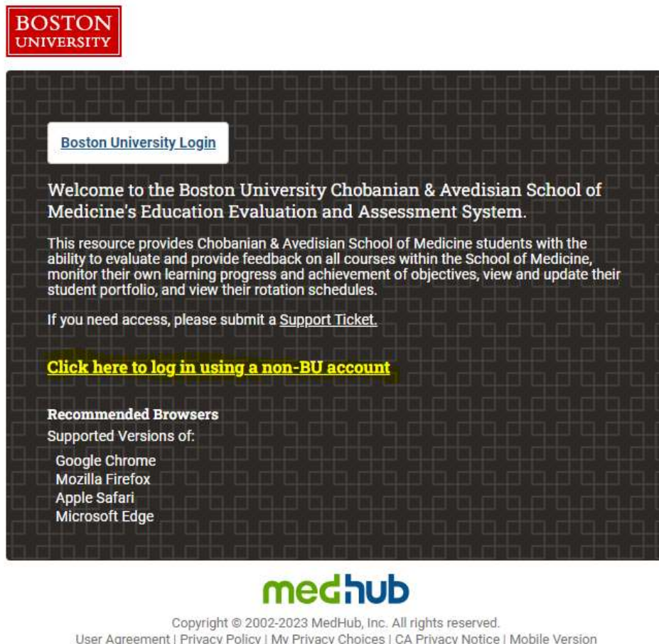
Figure 1 MedHub Login Page