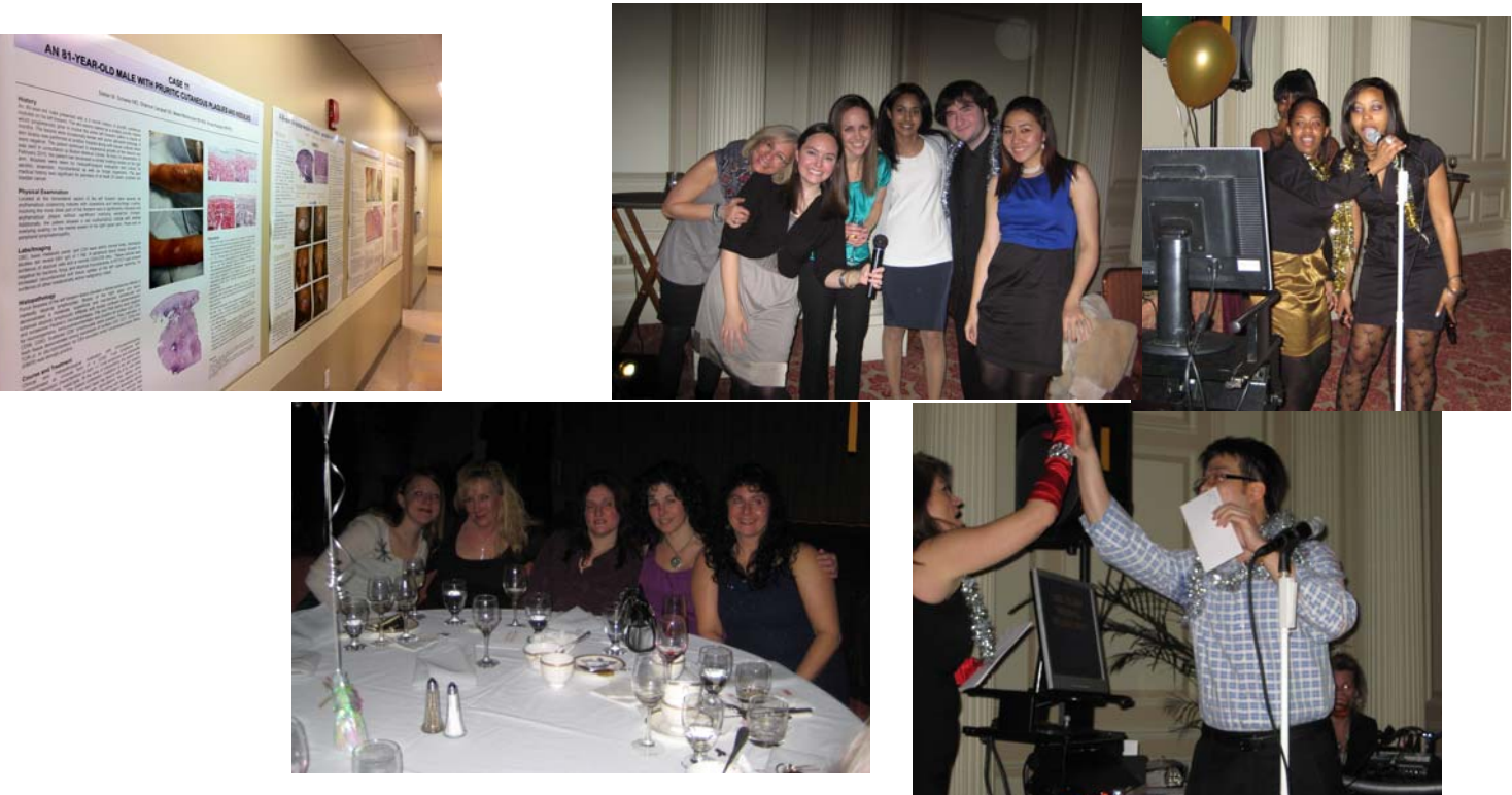
NEDS Meeting – December 4