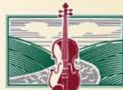
Neponset Valley Philharmonic Orchestra

To reserve tickets, visit www.melanomaprevention.org or call 781-875-1SPF (1773)