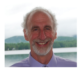
(article adapted from the BMJ blog "Primary Care Corner with Geoffrey Modest MD")

The American Diabetes Association has suggested that metformin be the initial therapy in all patients with type 2 diabetes, at least in part because it is cardioprotective. One frequent clinical issue is at what cut point in creatinine clearance should metformin be stopped.