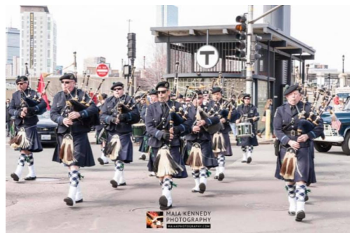
2019 South Boston St. Patrick's Day Parade