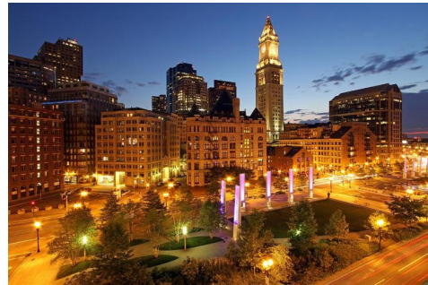
Glow in the Park This Friday Night