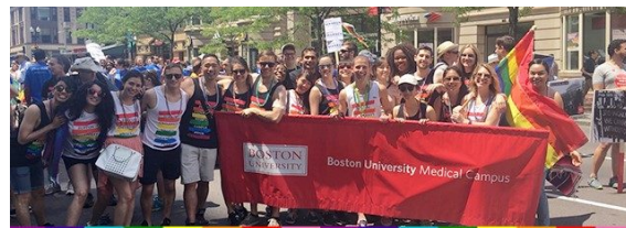
March with BUMC in the Boston Pride Parade

The parade begins at Copley Square at noon and ends at City Hall Plaza. Family and friends are welcome.