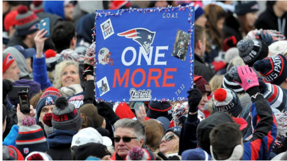
Super Bowl Viewing Parties Around Boston

President's Day Holiday- Classes Suspended: February 18th