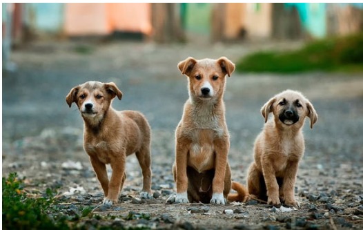
Dog's Personalities Can Change Over Time

Reminder: Fill out the commencement form that was emailed to graduating students