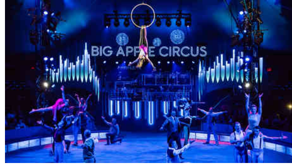
Big Apple Circus in Boston This Weekend